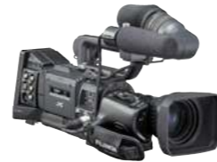
GY-HD250 ProHD 3-CCD ProHD Camcorder with 16X Fujinon Lens