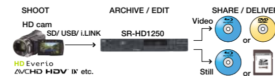
Share HD content #1: Edit and record footage from HD/SD camera to a disc via the HDD and share

Even without a PC, it is possible to copy video recordings onto a Blu-ray disc from an HD camcorder via the HDD or down convert video recordings and record them onto a DVD via the HDD. Dubbing (at high-speed or in a specific rec mode) between the internal HDD and Blu-ray disc/DVD or vice versa, is also possible.