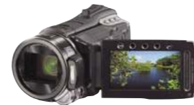
GZ-HM400 HD Everio HD Memory Camera